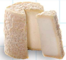
GAEC du Roux de l'Ane Vert (86230 Sossay)